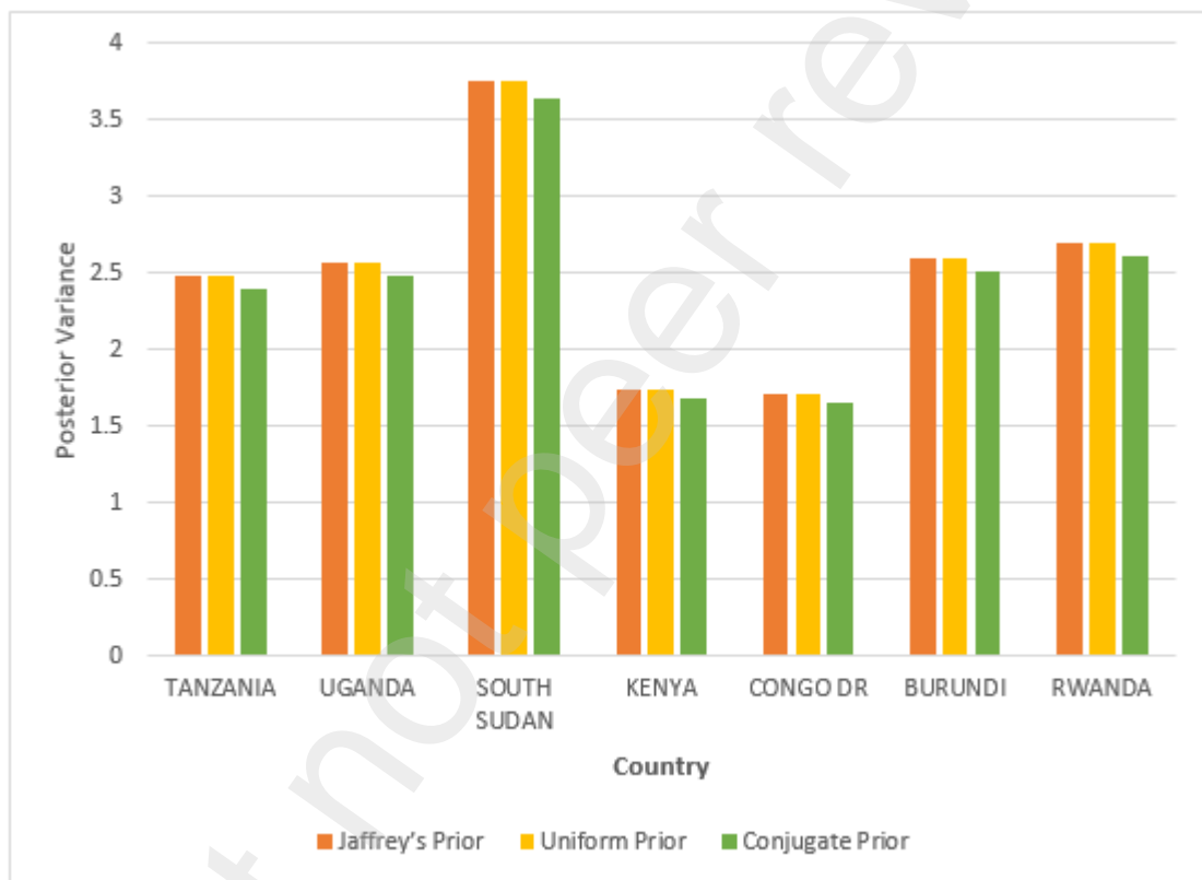
Figure 3: Posterior variance under different priors