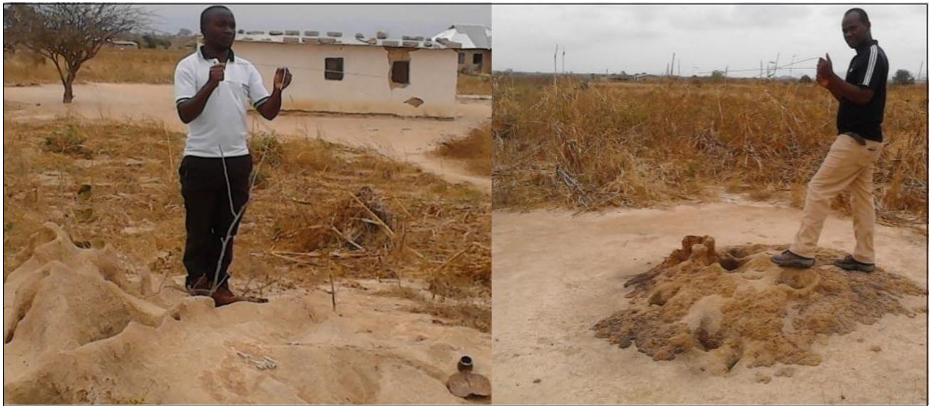
Fig. 5 Dowsing rods crossing on top of termite's mounds in Mtumba suburb indicating a closer water table, locals have trapped this technology to successfully explore and dig deeper SDWs

Mahoma Makulu, Gawaye, Msisi and, Mkondai suburbs. Indeed, several SDWs were placed along these trees and local people preserve the trees believing that they are themselves the sources of water (FGDS, FOs).