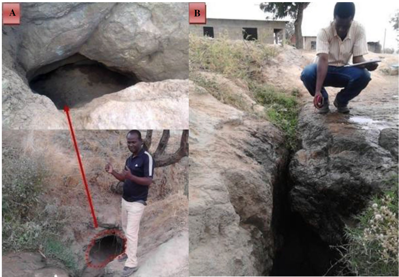
Fig. 4 Showing SDWs placed along natural fault systems. a Dowsing rods crossing on top of a SDW dug along a fault in Mahoma Makulu. b A very productive SDW along a fault system that is used for domestic and irrigation at Mtumba suburb. However, both wells are

vulnerable to pollution from runoff and periodical removal of debris is necessary. The SDWs in Mtumba are among the most productive in the area with an average yield of about 17 \text{ m}^3/\text{h} (Shemsanga et al. 2017)